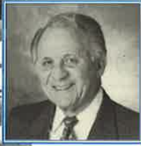
RETIRED BUSINESSMAN COLONEL, US AIR FORCE RESERVE (RETIRED) CHICO