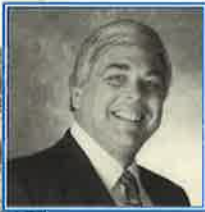
PRESIDENT, PARLAY INVESTMENTS, INC. REAL ESTATE INVESTMENT AND DEVELOPMENT COMPANY, REDDING