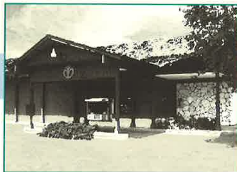
Fall River Mills