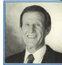
PRESIDENT, PETERSON FARMING, INC. DURHAM