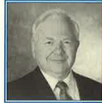
PHYSICIAN AND SURGEON, CHICO