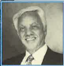
OWNER, BEICH COMPANY REAL ESTATE INVESTMENTS AND DEVELOPMENT, CHICO