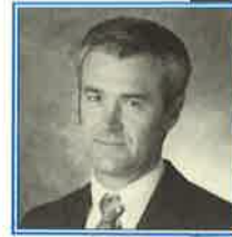
HEALTH CARE CONSULTANT, CHICO