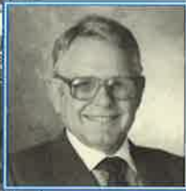
SECRETARY-TREASURER, PLAZA FARMS ORANGE GROWERS AND PACKERS, ORLAND