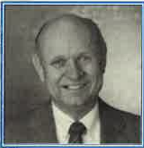
OWNER, WEHAH FARMS RICE AND GRAIN OPERATIONS, RICHVALE