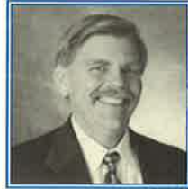
PRESIDENT, AVAG, INC. AERIAL APPLICATION BUSINESS, RICHVALE