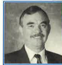
PRESIDENT AND CHIEF EXECUTIVE OFFICER TRI COUNTIES BANK AND TRICO BANCSHARES, CHICO